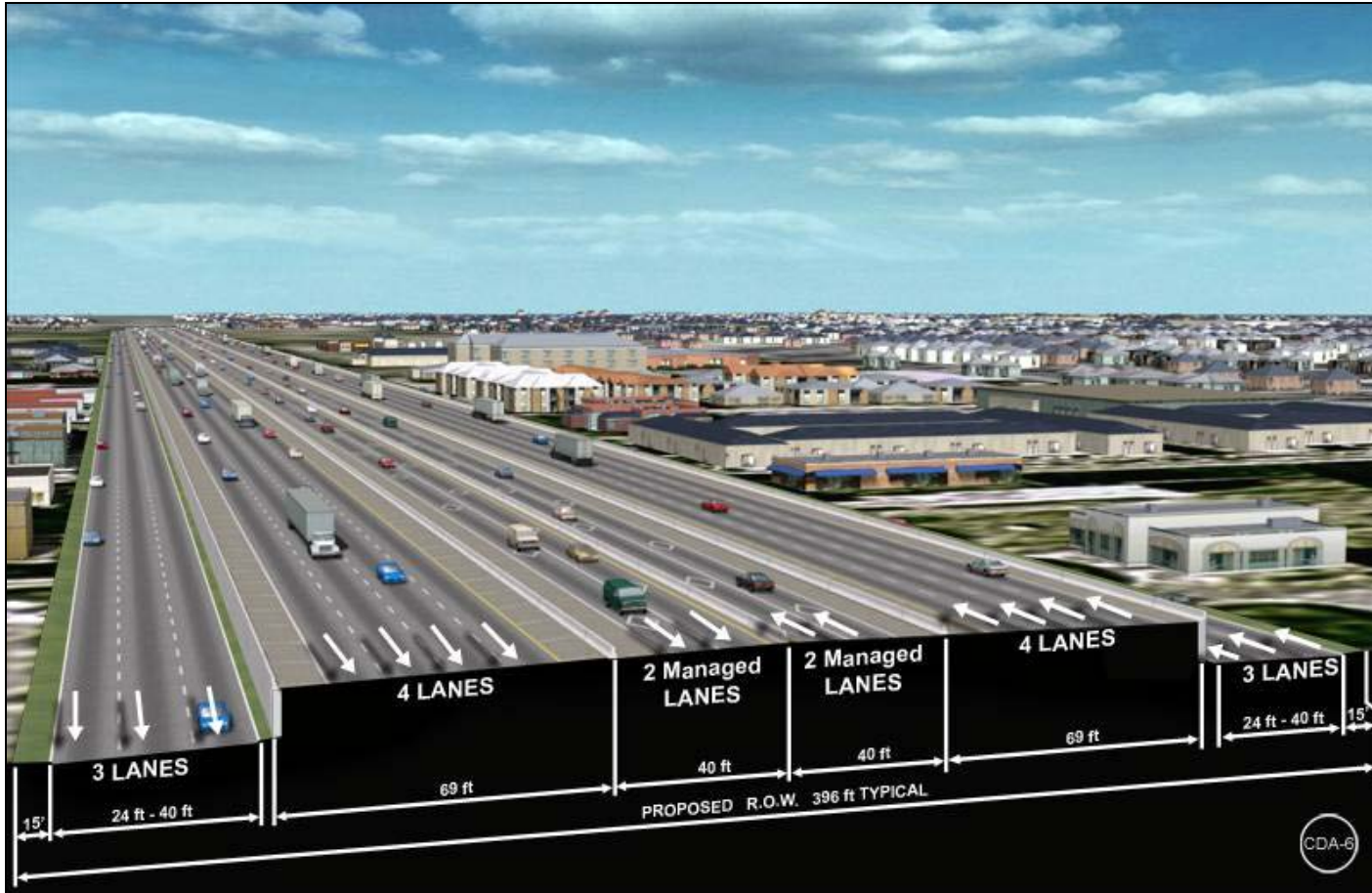
Future: Proposed SH 183 Managed Lanes concept, Middle Section