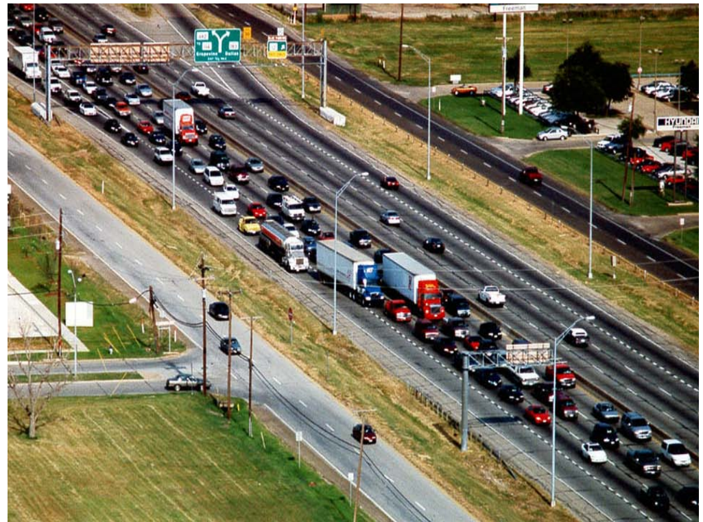
Present: Westbound SH 183 congestion near Loop 12