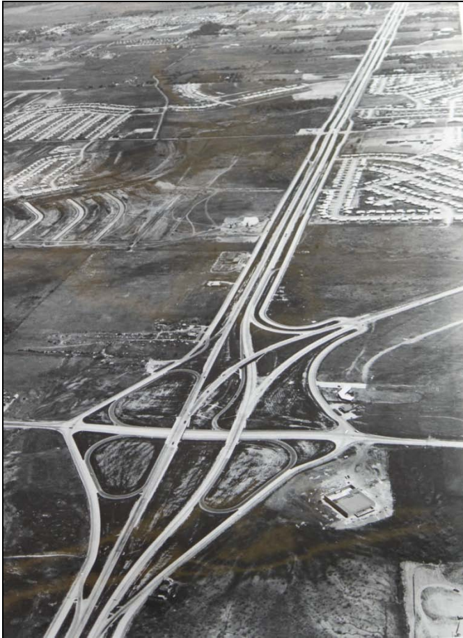
1959: State Highway 183 at Belt Line Road/Irving Blvd.