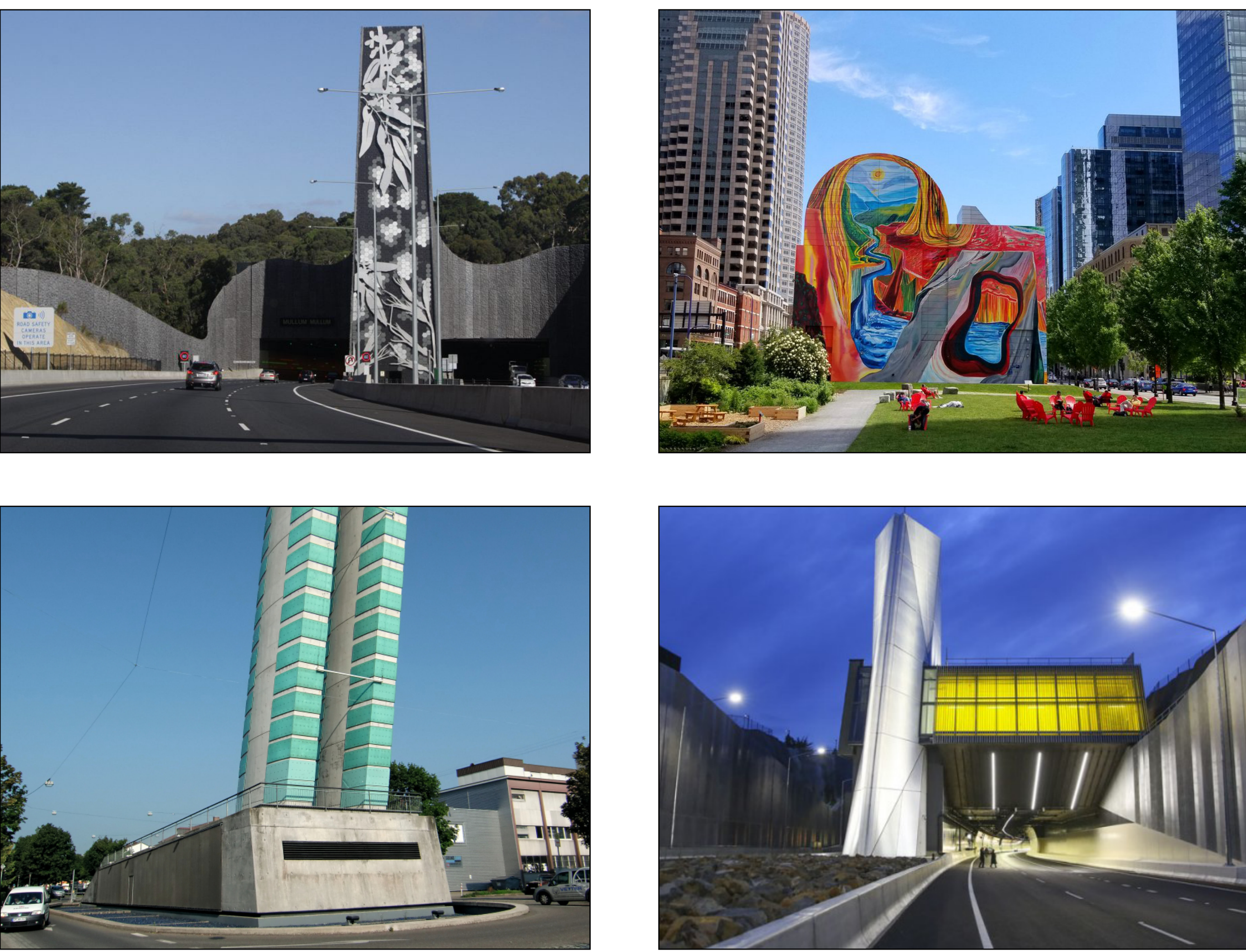
Ventilation Structures | Parks