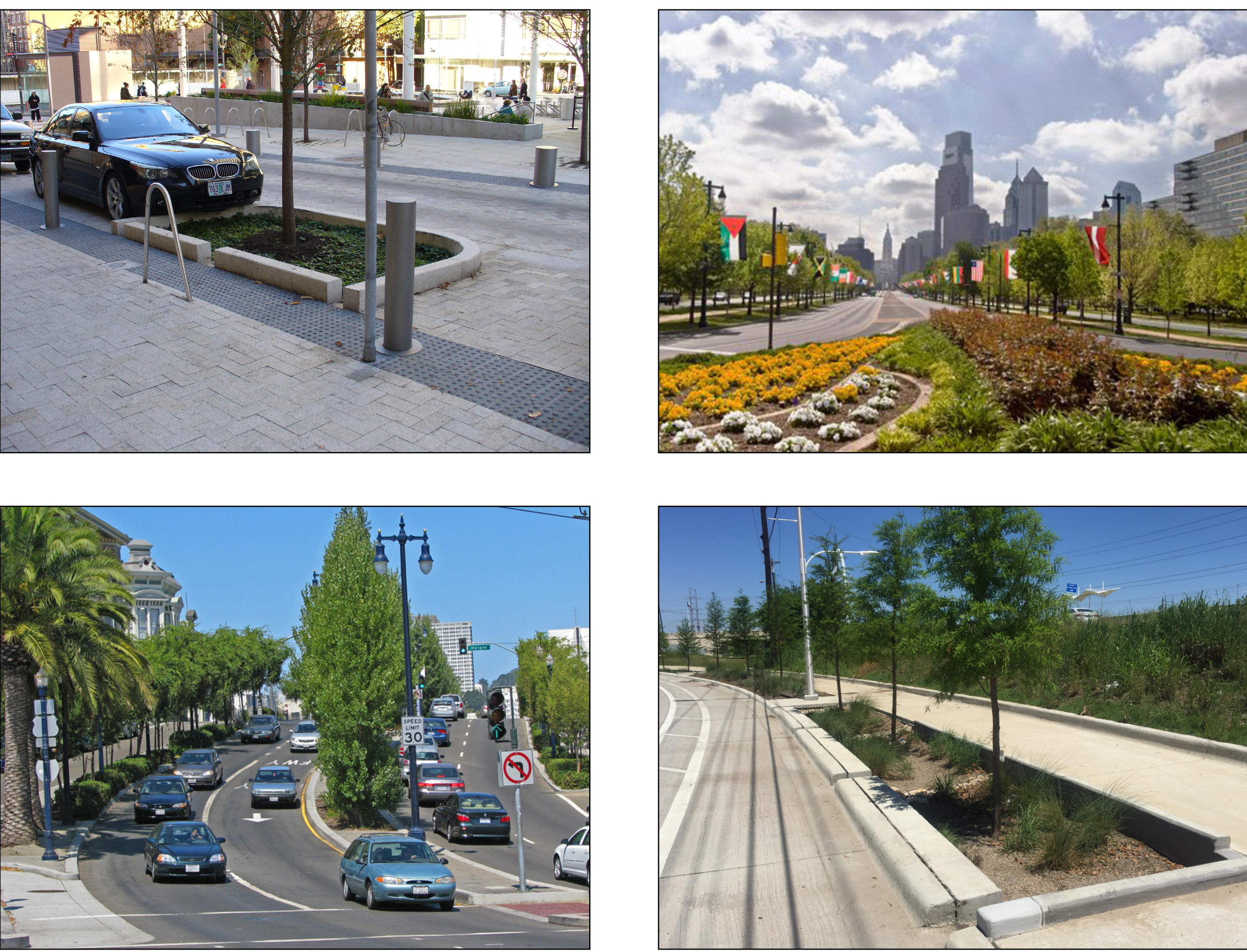
Local Streets | Roadways