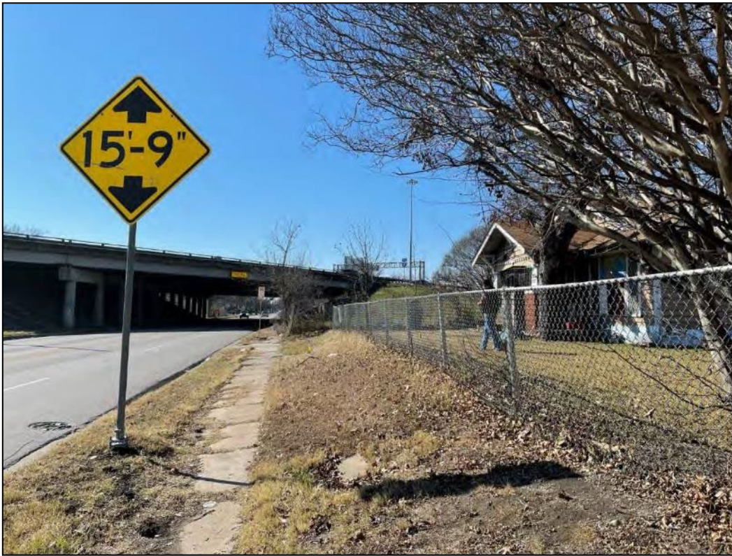
Photo 9 – View of project area from Lindsley Avenue – Camera facing southwest