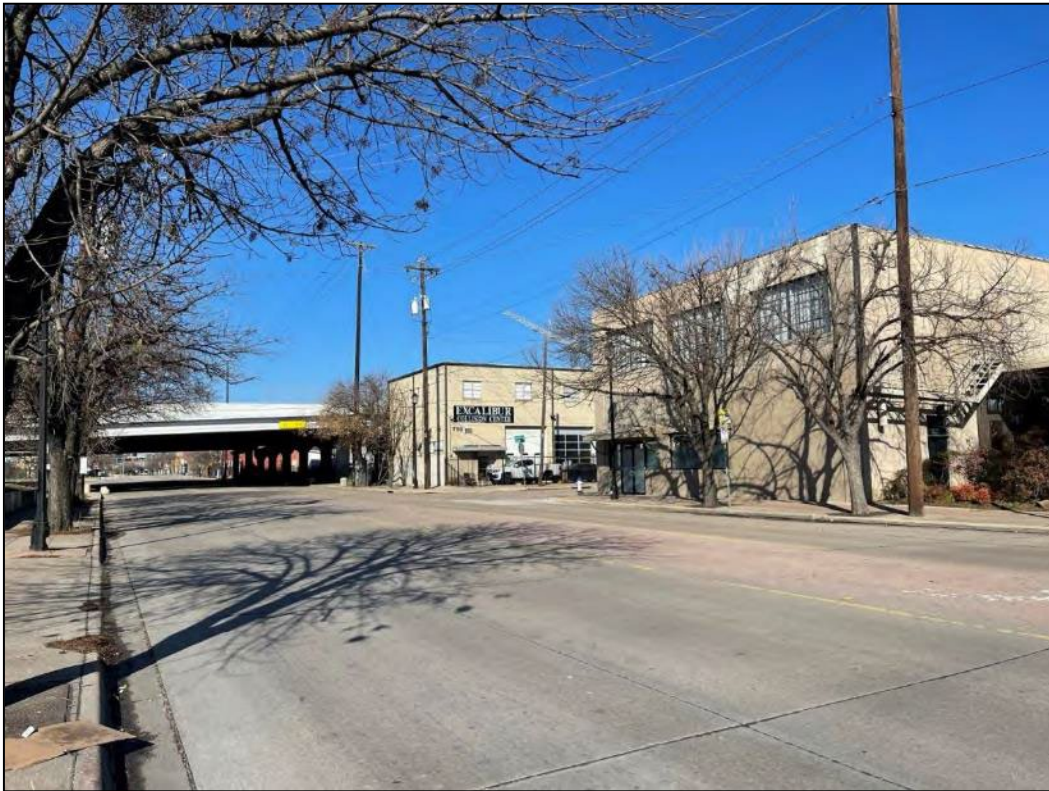
Photo 6 – View of project area from Exposition Avenue – Camera facing west