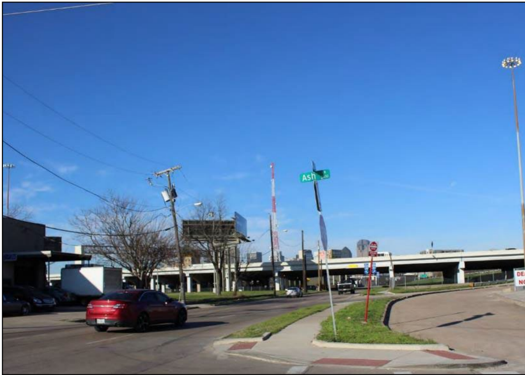
Photo 5 – View of project area from intersection of Ash Lane and 1st Avenue – Camera facing west