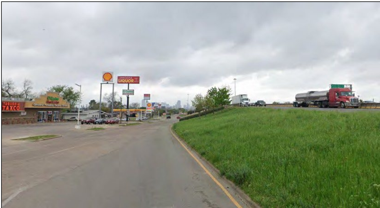
Photo 12 – View of project area along E.R.L. Thornton – Camera facing west