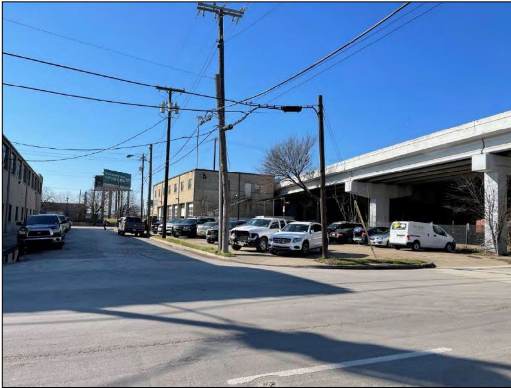
Photo 7 – View of project area from Commerce Street – Camera facing southwest