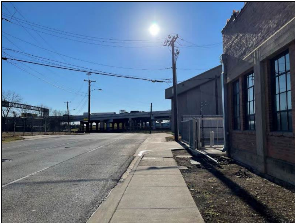
Photo 4 – View of project area from 2nd Avenue – Camera facing southeast