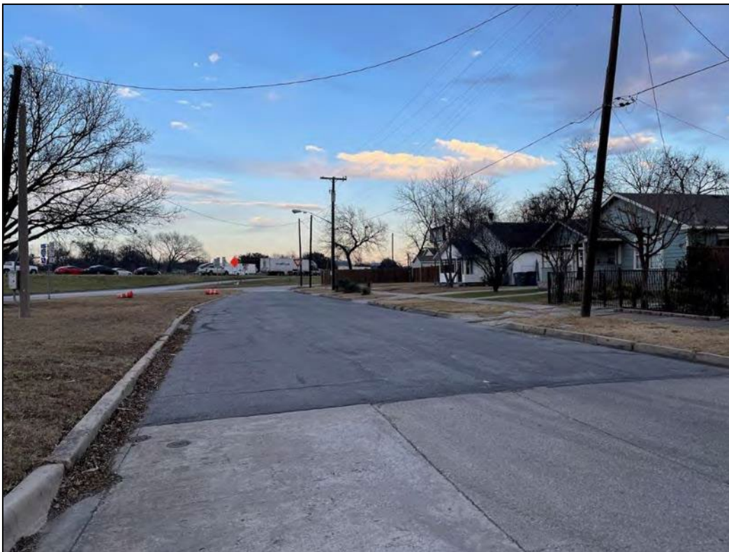
Photo 10 – View of project area from Phillip Avenue – Camera facing northeast