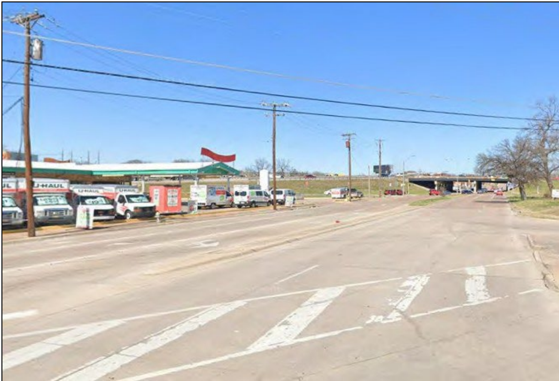
Photo 14 – View toward project area from Ferguson Road – Camera facing northeast