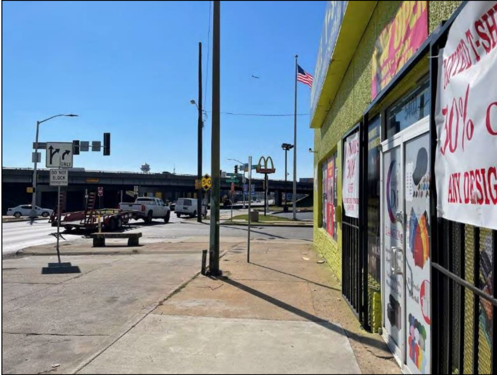
Photo 11 – View of project area from East Grand Avenue – Camera facing southwest