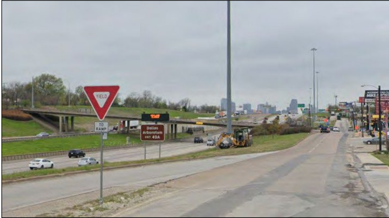
Photo 13 – View of project area along Merrifield Avenue – Camera facing west