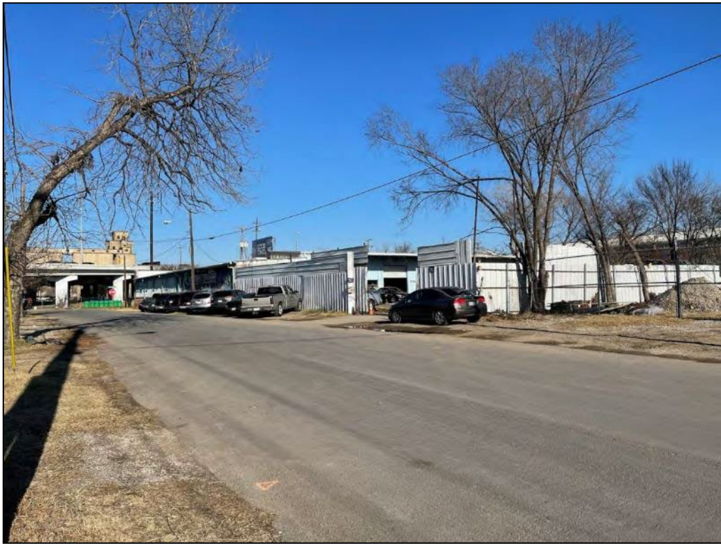
Photo 3 – View of project area from Dawson Avenue – Camera facing northeast