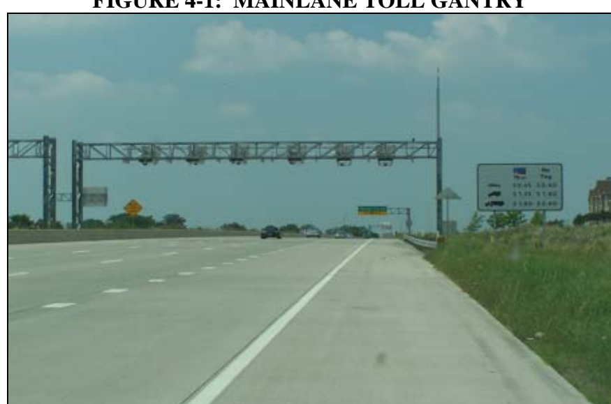
FIGURE 4-1: MAINLANE TOLL GANTRY