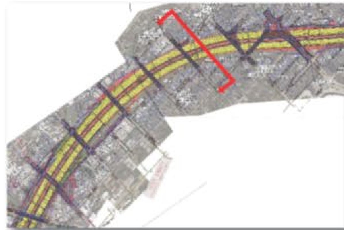
Existing I-30 Google Earth Birdseye Looking West (vista existente de I-30 mirando al oeste de Google Earth)