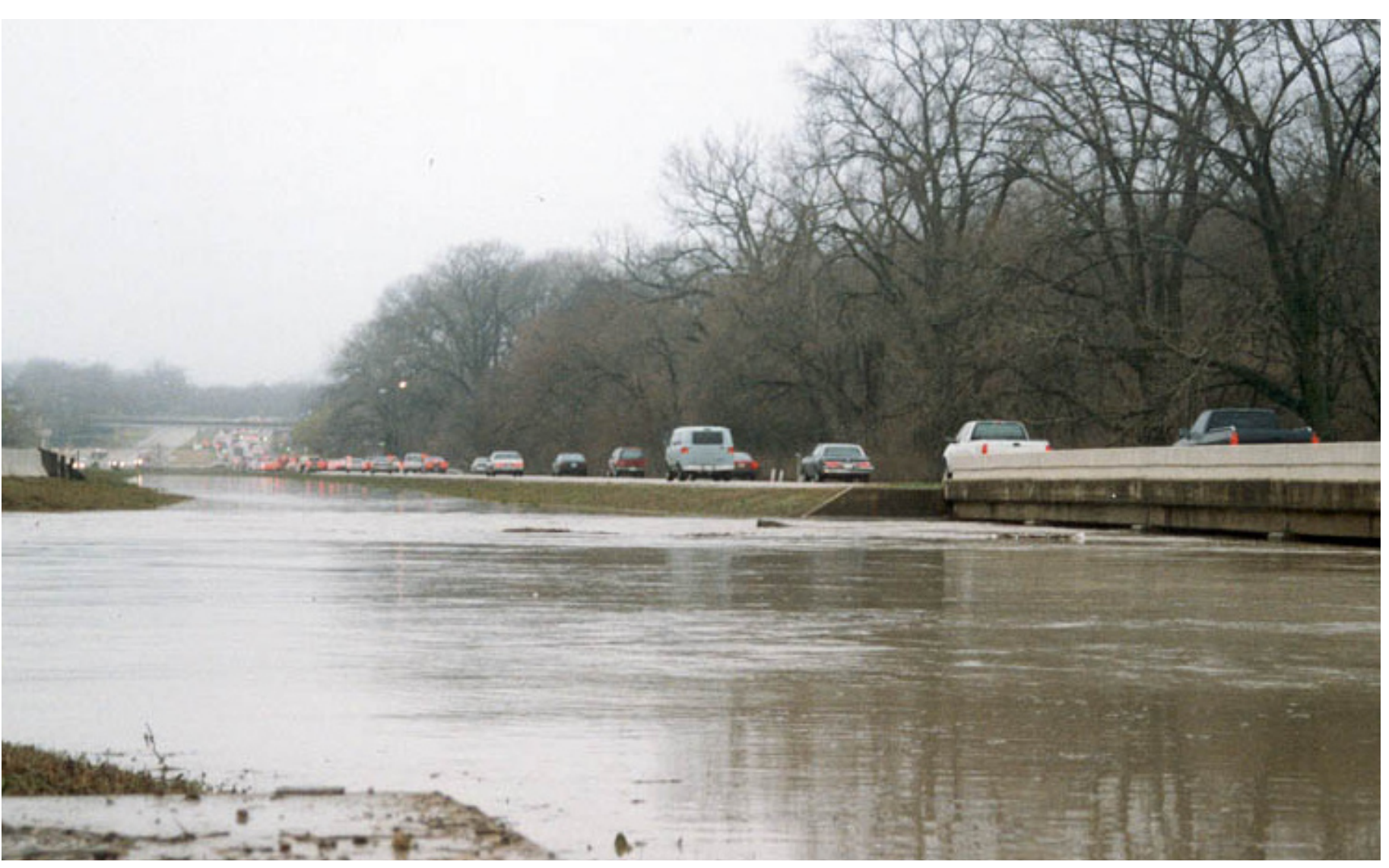
Existing Bridges on Loop 12/Northwest Hwy, Looking West Towards the DART Rail Line