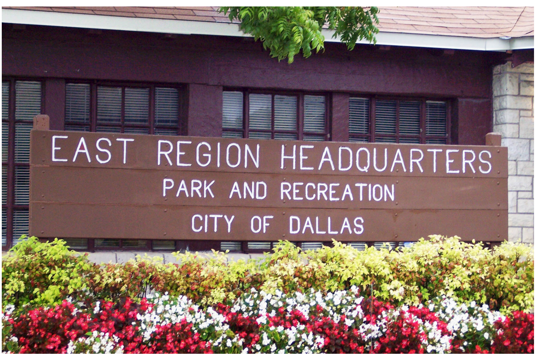
New Trail and Parking Lot Improvements will be Constructed at the Existing East Region Headquarters Building.