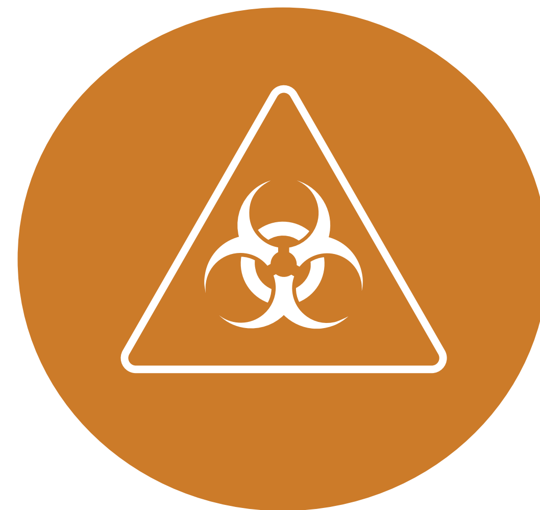
Hazardous Materials Sites