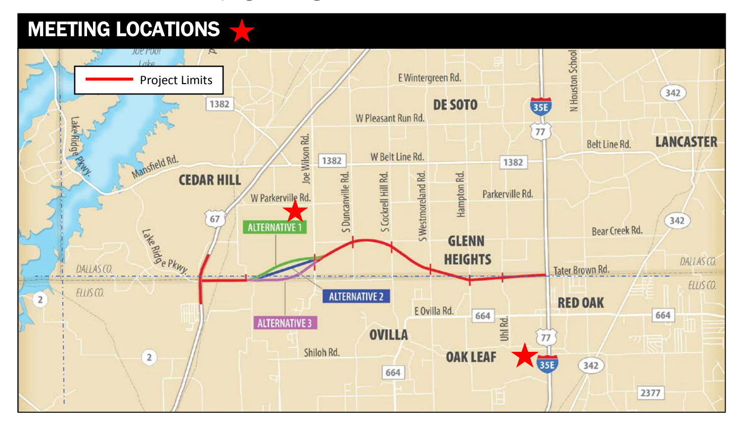
TxDOT will host two Public Scoping Meetings to discuss Loop 9, Segment A in Dallas and Ellis Counties. For more information about the project, visit: www.keepitmovingdallas.com or www.txdot.gov