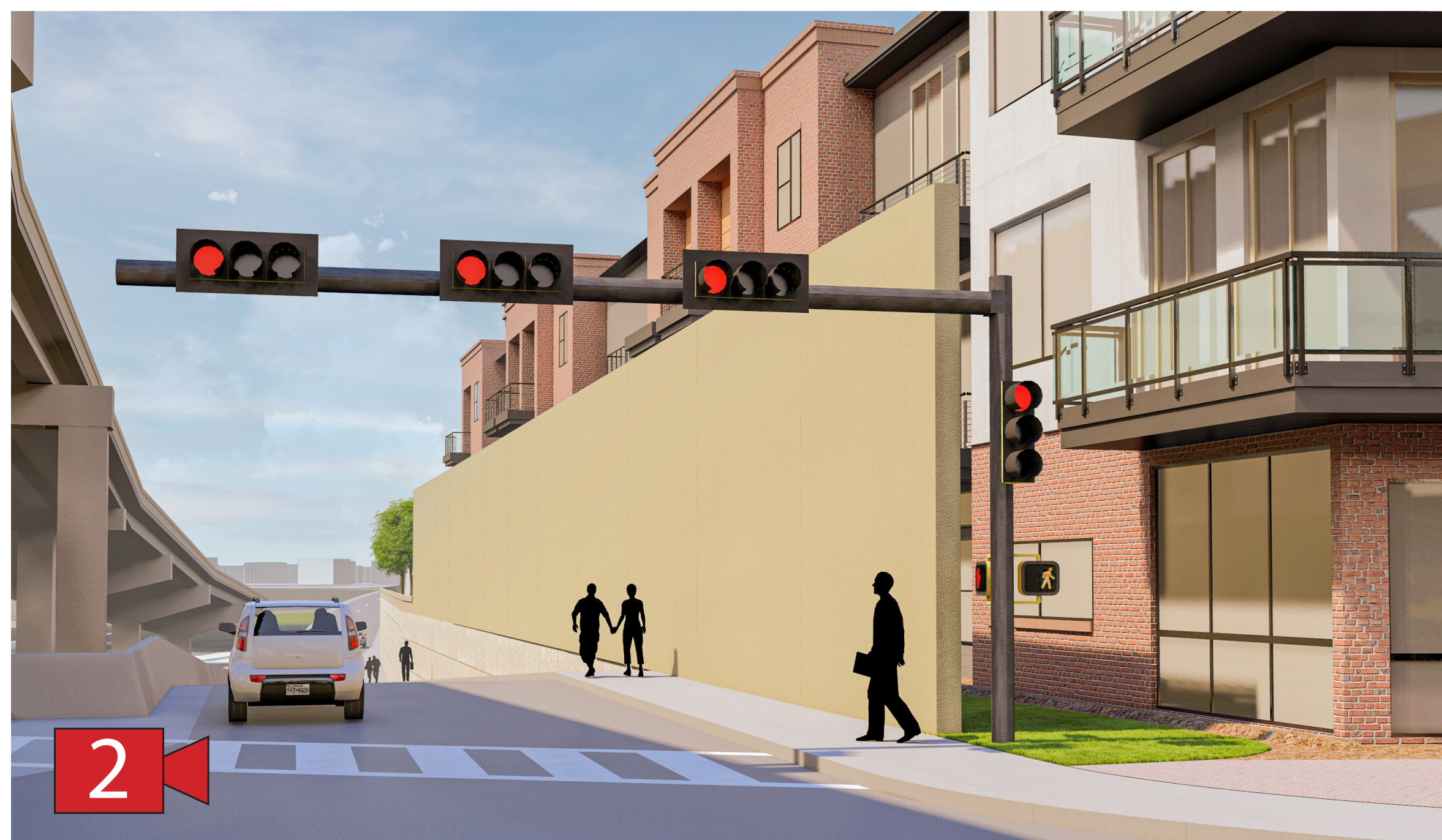
Ground View - Front of Noise Barrier