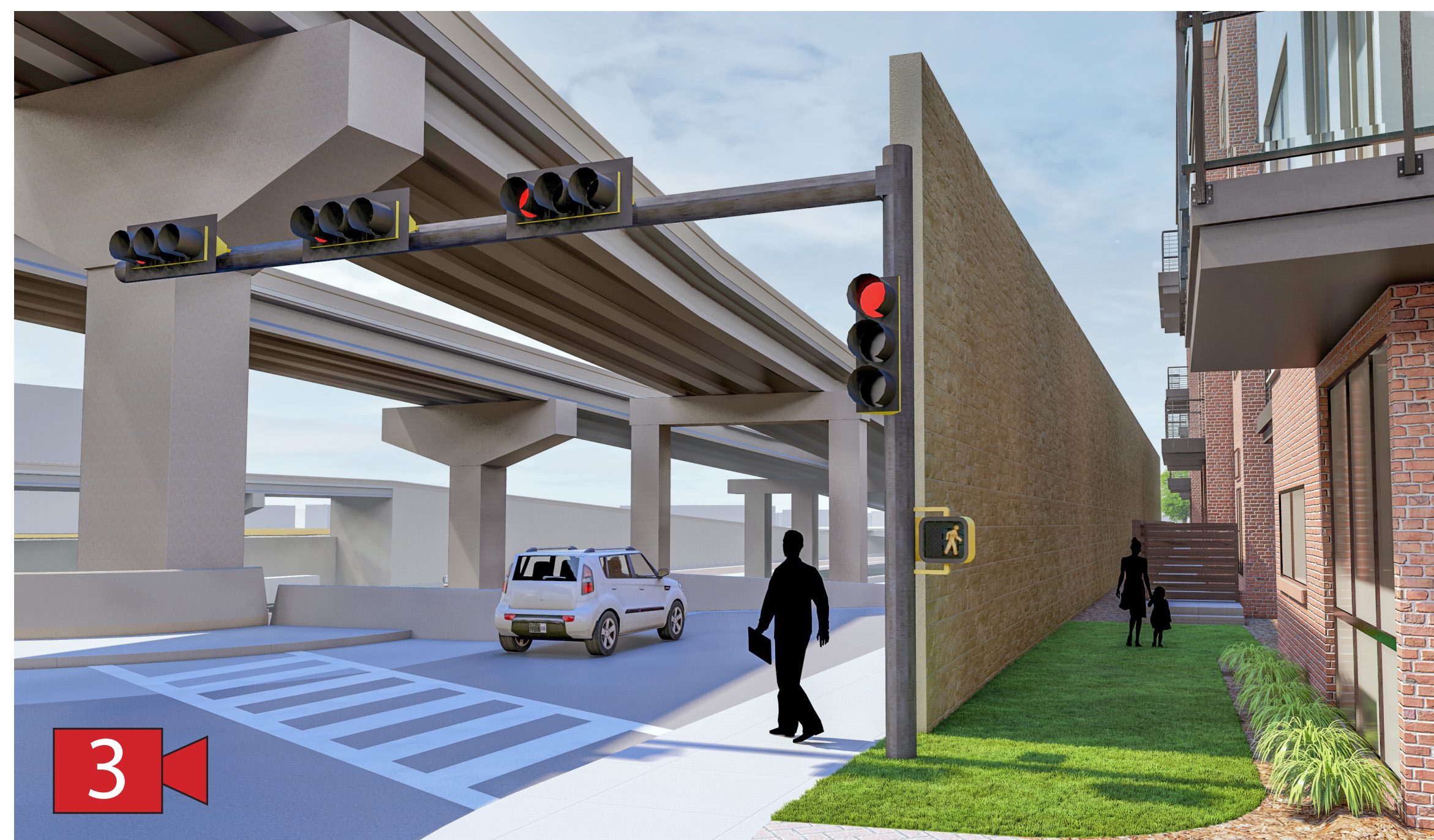
Ground View - Back of Noise Barrier