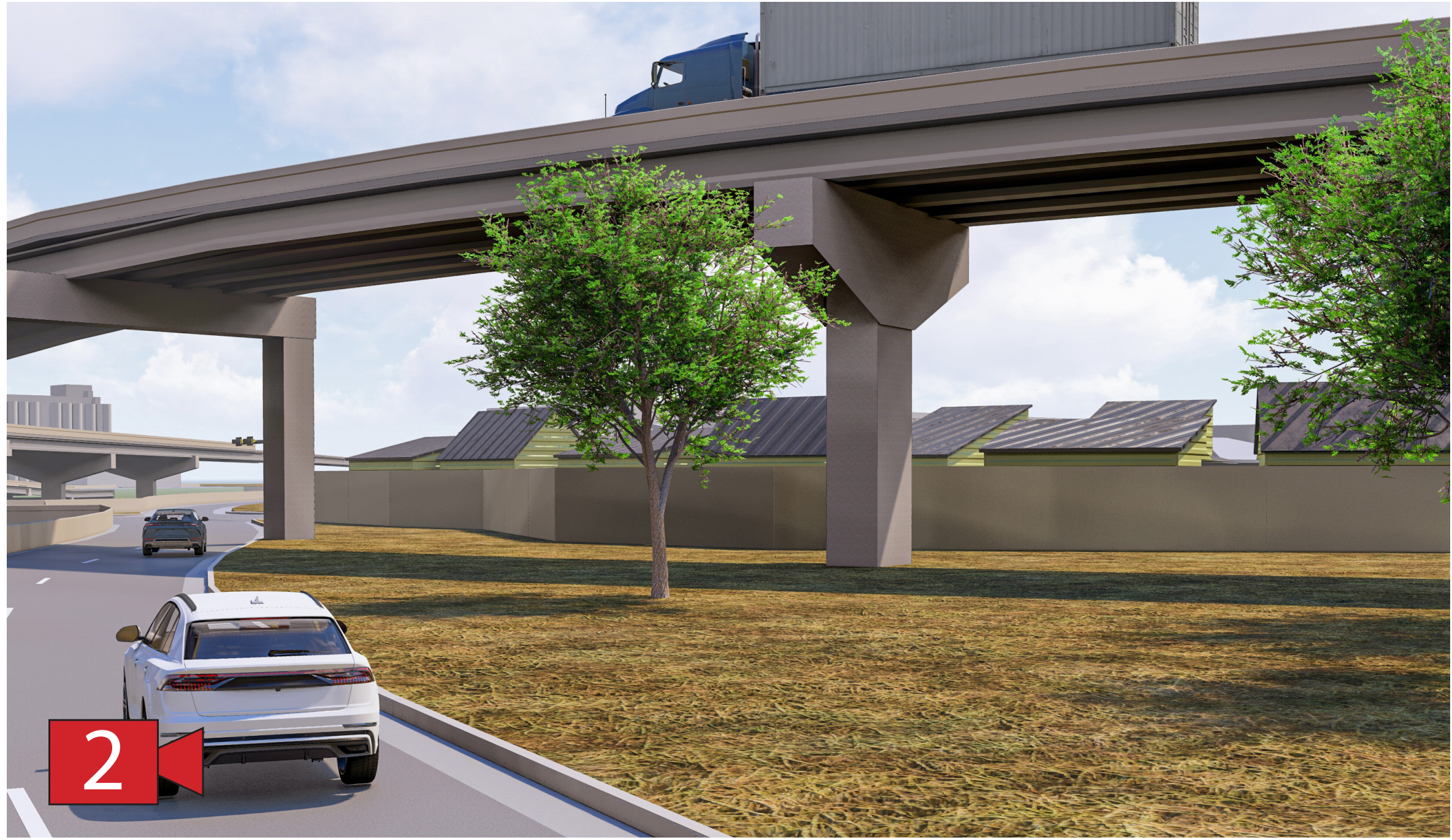
Ground View - Front of Noise Barrier