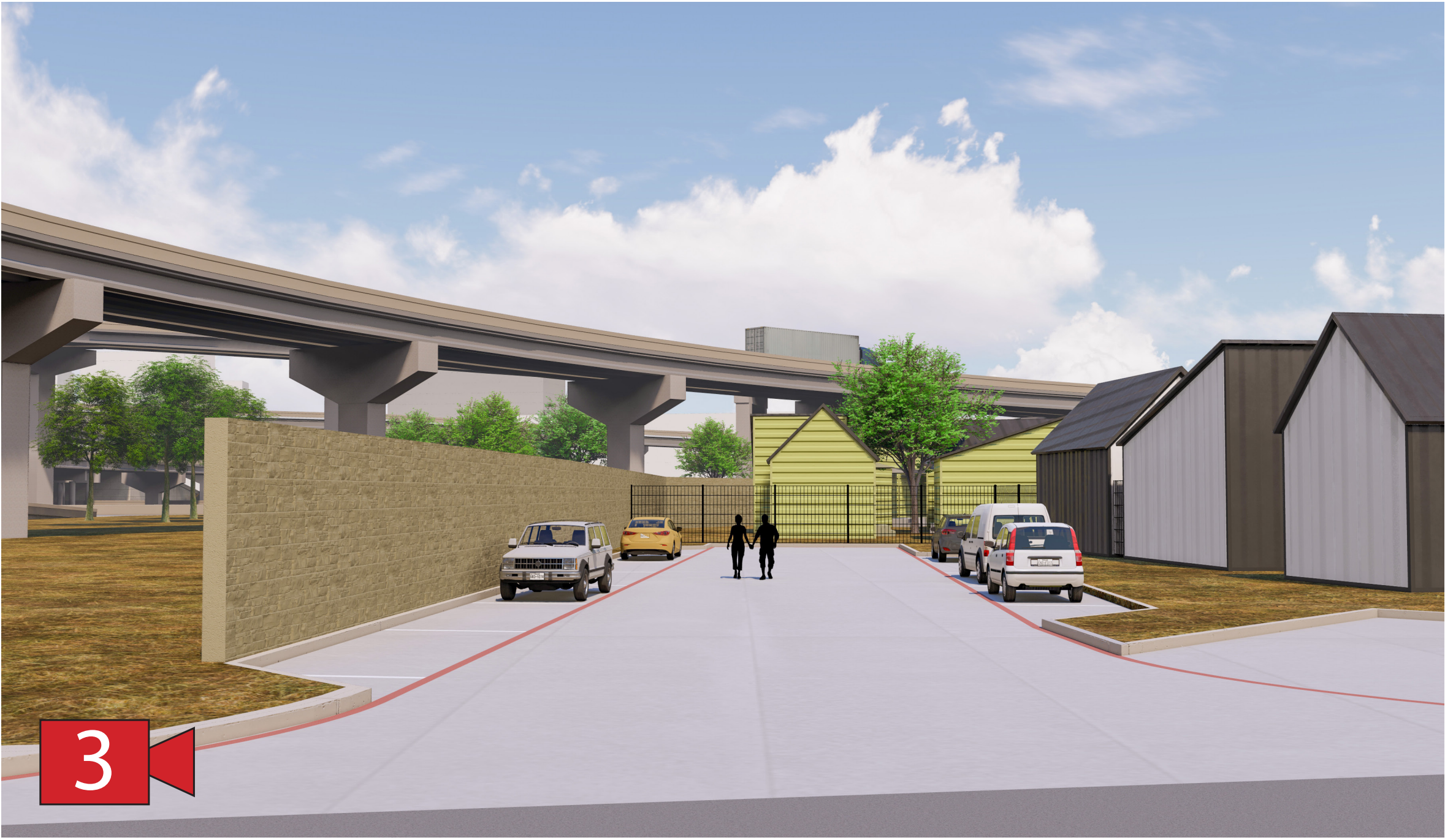
Ground View - Back of Noise Barrier