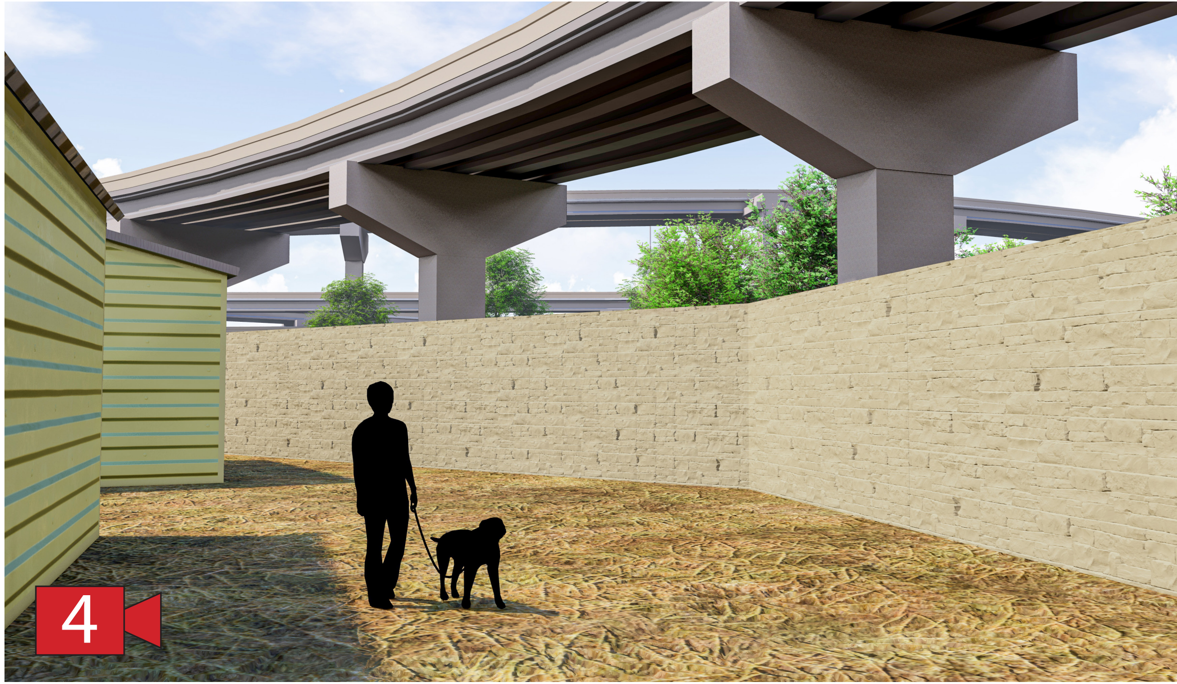
Ground View - Back of Noise Barrier

The renderings are not to scale and shown for illustrative purposes only. Actual views are subject to change.