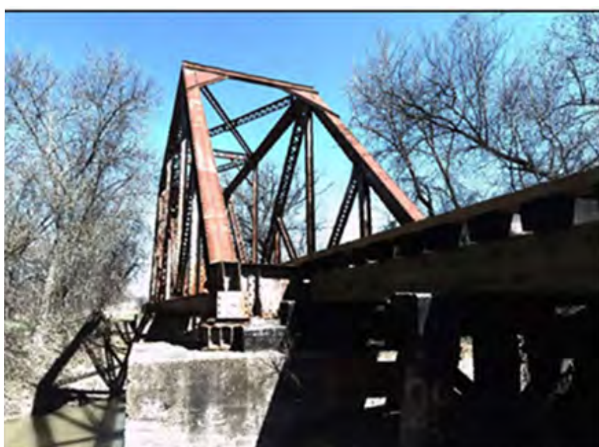
Houston & Texas Central Thru-Truss Bridge