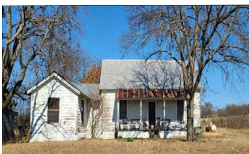
2163 E. Dave Brown Road

Resources in the US 380 from Coit Road to FM 1827 study area that may be protected under Section 106 and/or Section 4(f) include: