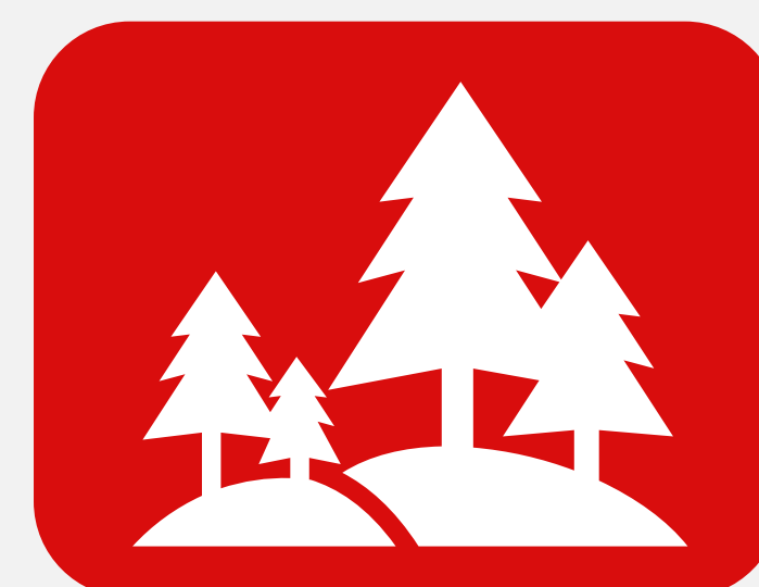
Vegetation and Wildlife