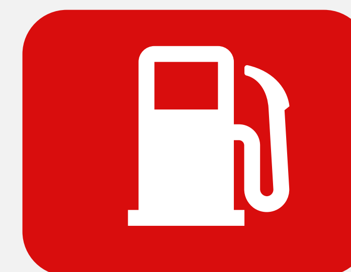
Hazardous Materials Sites