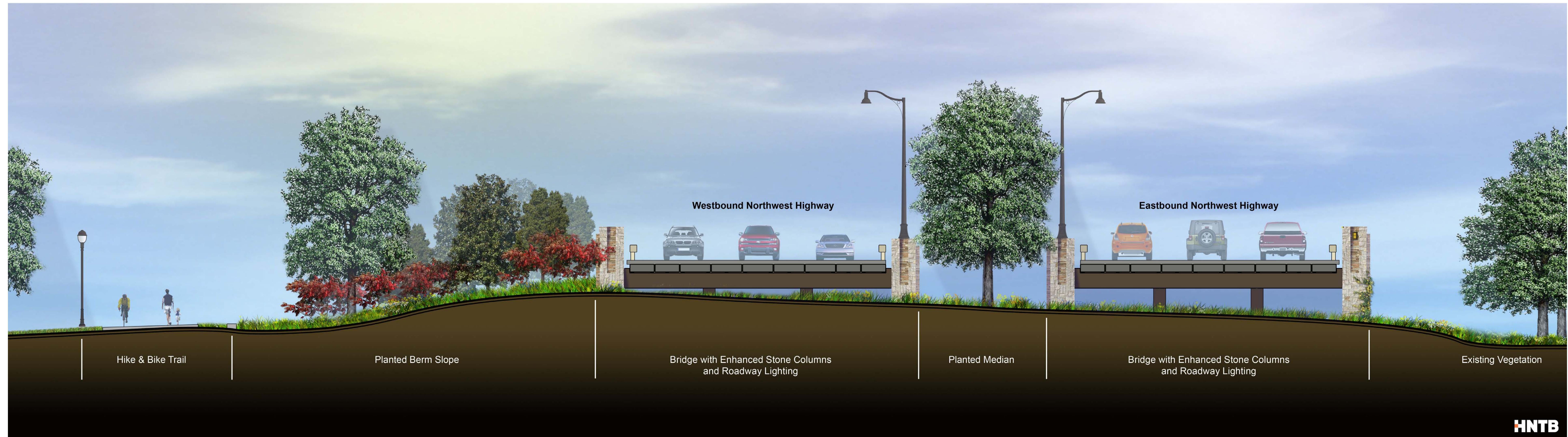
Roadway and Bridge Section