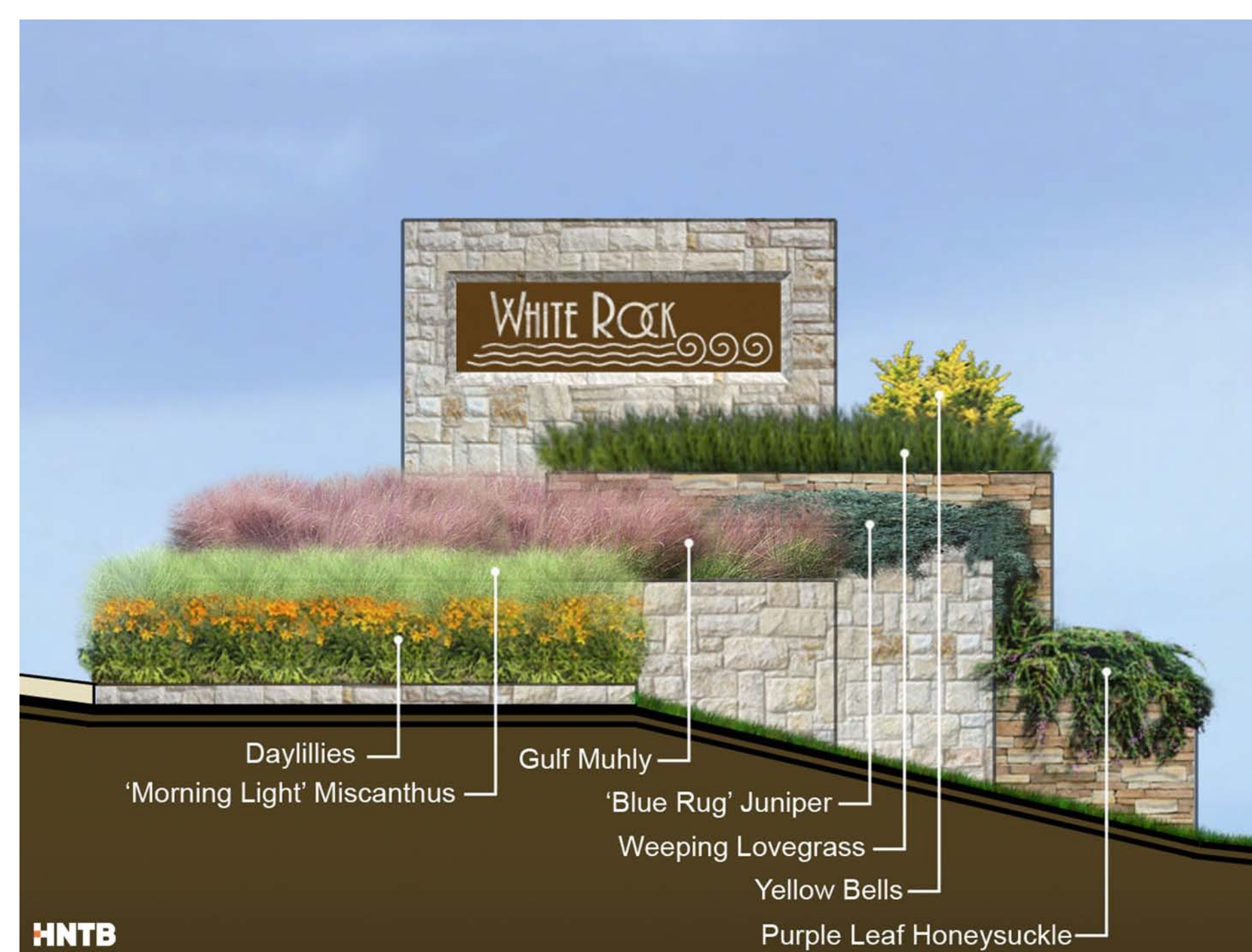
Gateway Monument Detail